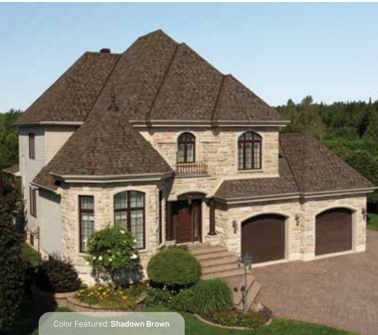
Color Featured: Shadow Brown

Do you want your home to stand out dramatically or blend in harmoniously? Either way, you're sure to boost your home's curb appeal and potentially its resale value with our high-quality Performance shingles.