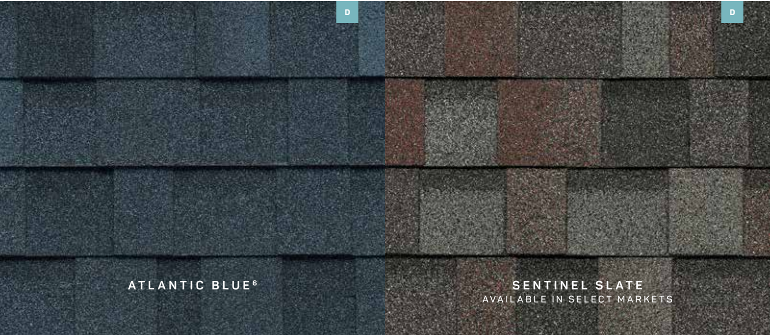
ATLANTIC BLUE 6

PERFECT PAIRINGS: White or grey stone, brick or siding; black, white or grey trim.