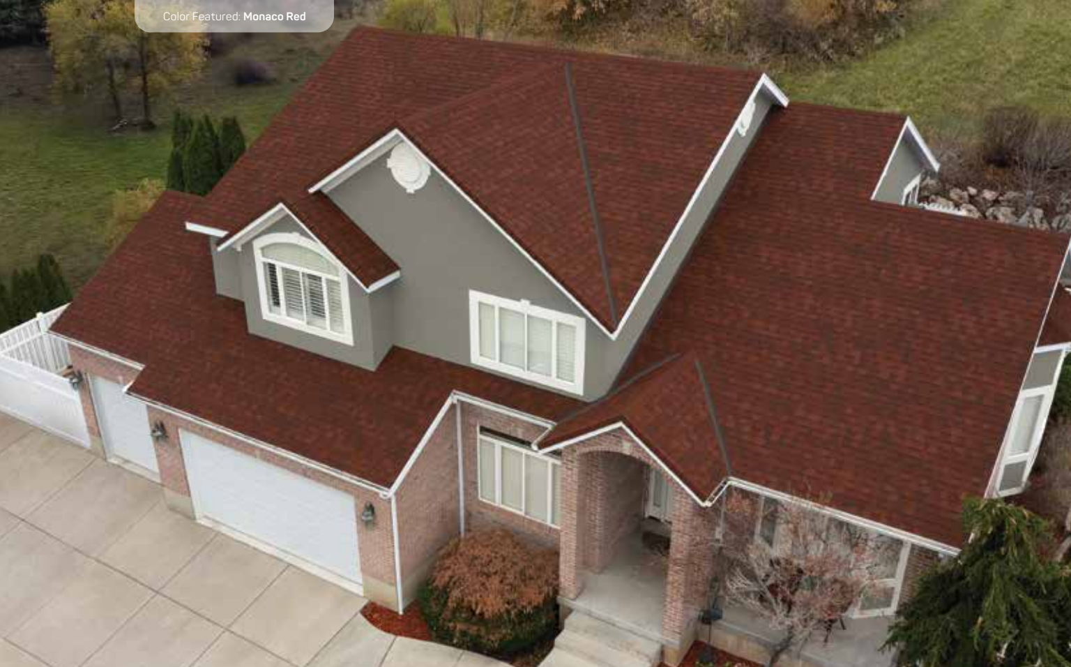
Color Featured: Monaco Red