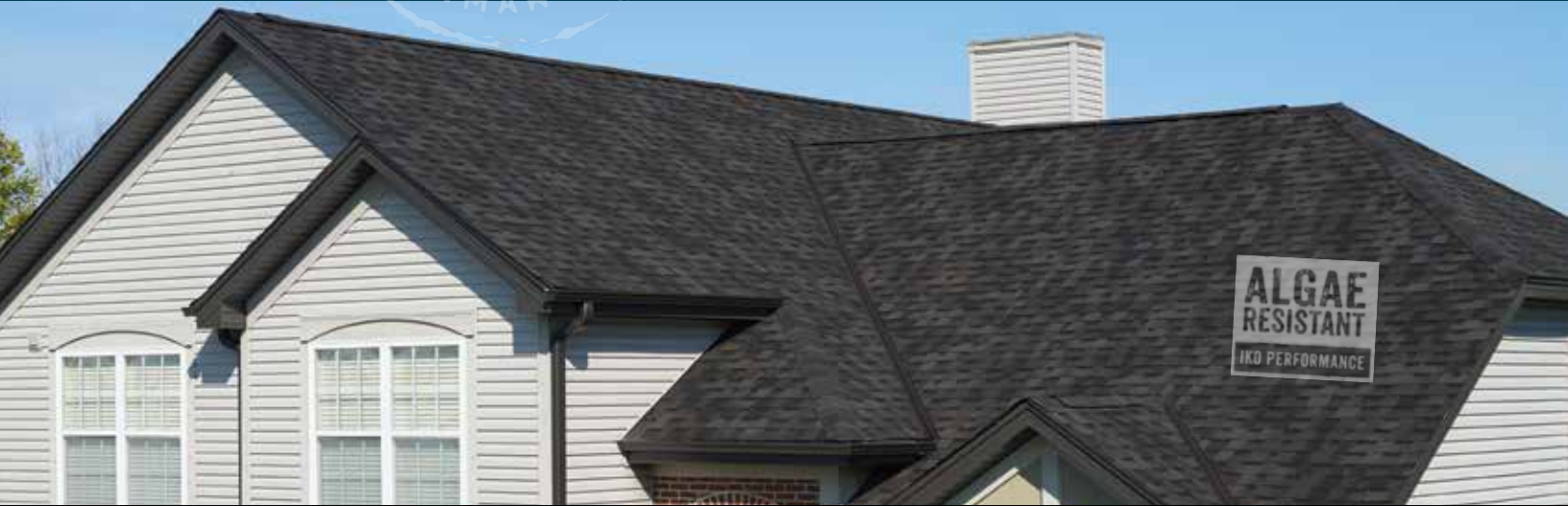
Color Featured: Glacier