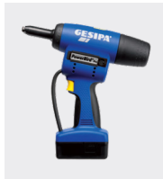
PowerBird® Pro Gold Rivet Tool