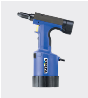
TAURUS® 2 TPR Tool

Tools: A specially designed pulling tool is required for all installations and is available in pneumatic and hand operated models. (Example tools not sold by IKO.)