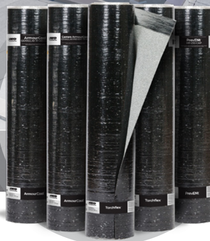
IKO HEAT-WELDED CAP SHEETS