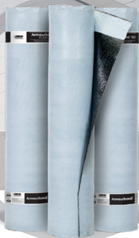
IKO PEEL AND STICK BASE SHEETS